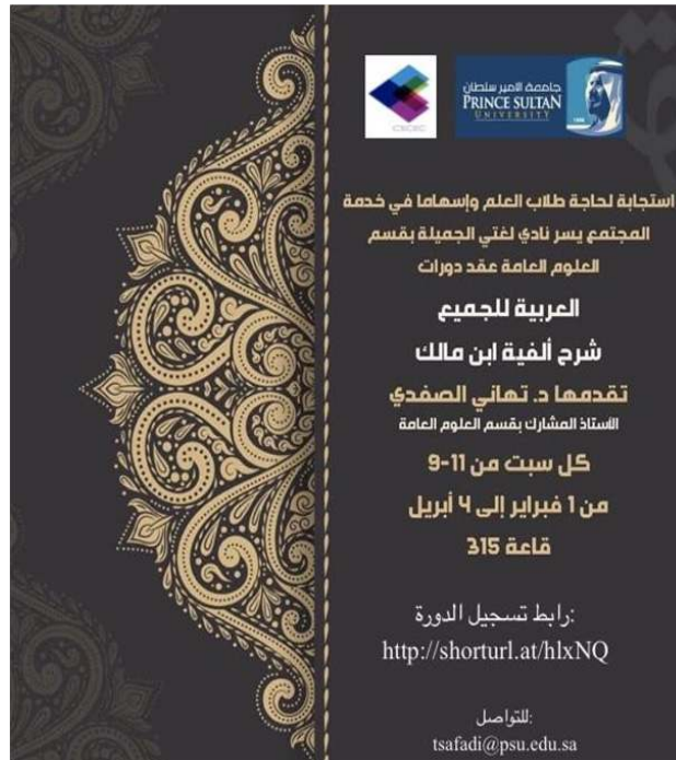
Weekly Arabic Language Analysis Workshop Sessions

CSCEC implemented several sessions of Arabic Language Analysis workshops in collaboration with the general courses department presented by PSU faculty member. The audience of these workshops were women from society who are interested in knowing more about Arabic, as a language. The main aim was to raise awareness of our culture among society. The number of attendees was 31 and the workshops were conducted on every Saturday from 9:00 am-11:00 am. The attendees from the public were glad and expressed gratitude to find PSU as an academic venue to share their interest in Arabic language knowledge.