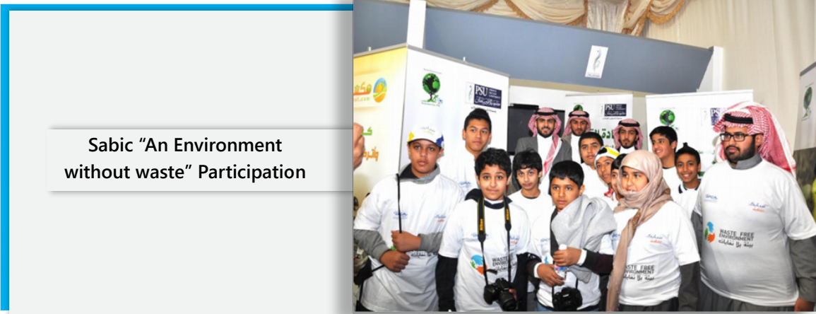
Sabic "An Environment without waste" Participation

The University supports research on climate change and activities to promote sustainable environment.