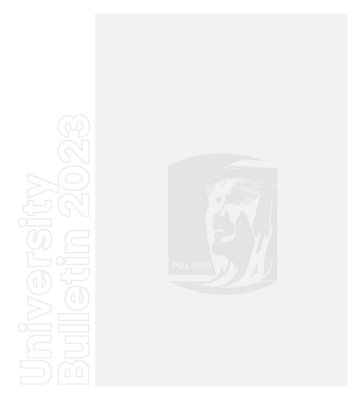
Prince Sultan University Deanship of Admissions and Registration www.psu.edu.sa